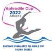
FIG RHYTHMIC GYMNASTICS WORLD CUP INDIVIDUAL AND GROUP APHRODITE CUP PALAIO FALIRO, ATHENS 18-20 MARCH 2022