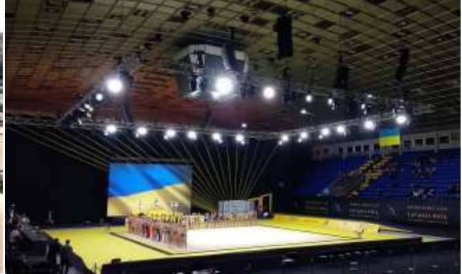
Field of Play