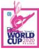
FIG RHYTHMIC GYMNASTICS WORLD CUP PESARO (ITA) 03 – 05 APRIL 2020 INDIVIDUAL AND GROUP