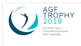
FIG TRAMPOLINE GYMNASTICS WORLD CUP AGF TROPHY "TOKYO 2020 QUALIFYING WORLD CUP" BAKU, AZERBAIJAN FEBRUARY 16 & 17, 2019